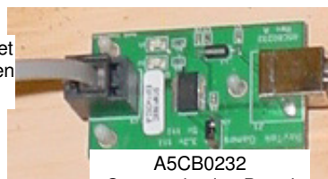
A5CB0232 Communication Board