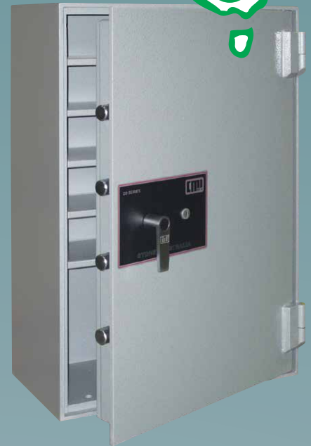
■ MODEL DS900