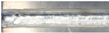
Single Pulse MIG – Using 1.0mm AL5356 Aluminium Wire welding 3.0mm sheet using right to left push technique.

This machine can also be used in Pulse Mode with the optional Weldclass Spool Gun and makes welding Aluminium much easier as it reduces wire feedability problems, especially birds-nesting (tangles) and burn back to the contact tip.