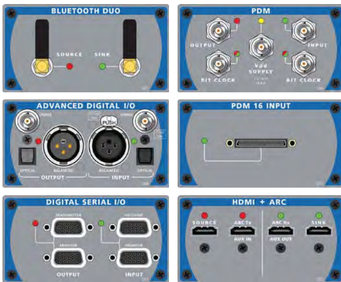
The B Series APx platform incorporates a modular architecture enabling configuration for a variety of digital I/O options.