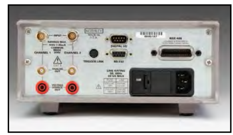
Model 2502 rear panel

The Model 2502 offers low current measurement ranges from 2nA to 20mA in decade steps. This provides for all photodetector current measurement ranges for testing laser diodes and LEDs in applications such as LIV testing, LED total radiance measurements, measurements of cross-talk and insertion loss on optical switches,