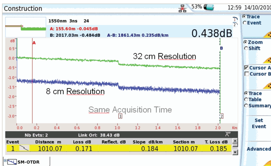
Figure 2. High resolution requires more acquisition time to achieve optimized trace

For example, the acquisition time it takes to make a given trace/dynamic range for a 0.5 meter sampling resolution is approximately 4 times longer than a similar trace with a 2 meter resolution setting. Understanding this is critical when evaluating any fiber link, as testing time becomes increasingly important. The VIAVI OTDRs optimize testing time by enabling users to eventually set their own sampling resolution (and with automatic setups).