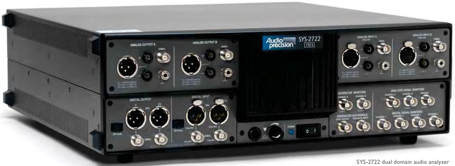
SYS-2722 dual domain audio analyzer

Extraordinary performance in a renowned audio analyzer