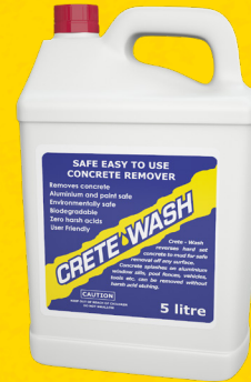
CW5L 5 Litre Bottle