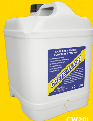
CW20L 20 Litre Drum