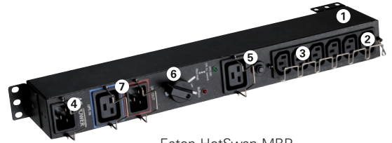
Eaton HotSwap MBP