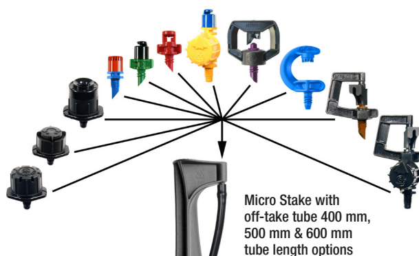
Micro Stake with off-take tube 400 mm, 500 mm & 600 mm tube length options