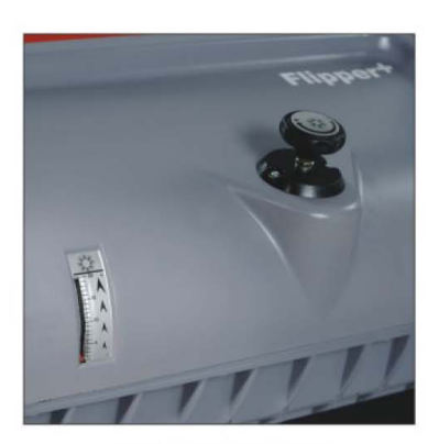
BRUSH ADJUSTMENT The brush pressure adjustment knob and the brush pressure reading scale enables the optimum adaptation of the brushes to all floor conditions and types of dirt