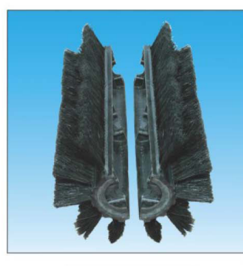
SPLIT-HALF BRUSHES The newly designed split-half brush ensures easy replacement and cleaning of the brush and bristles.