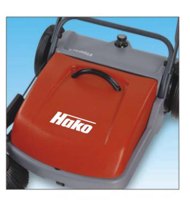
HOPPER Sturdy, rust-free, light-weight, roto-mould hopper fitted with a handle, aids in the easy disposal of the collected materials.