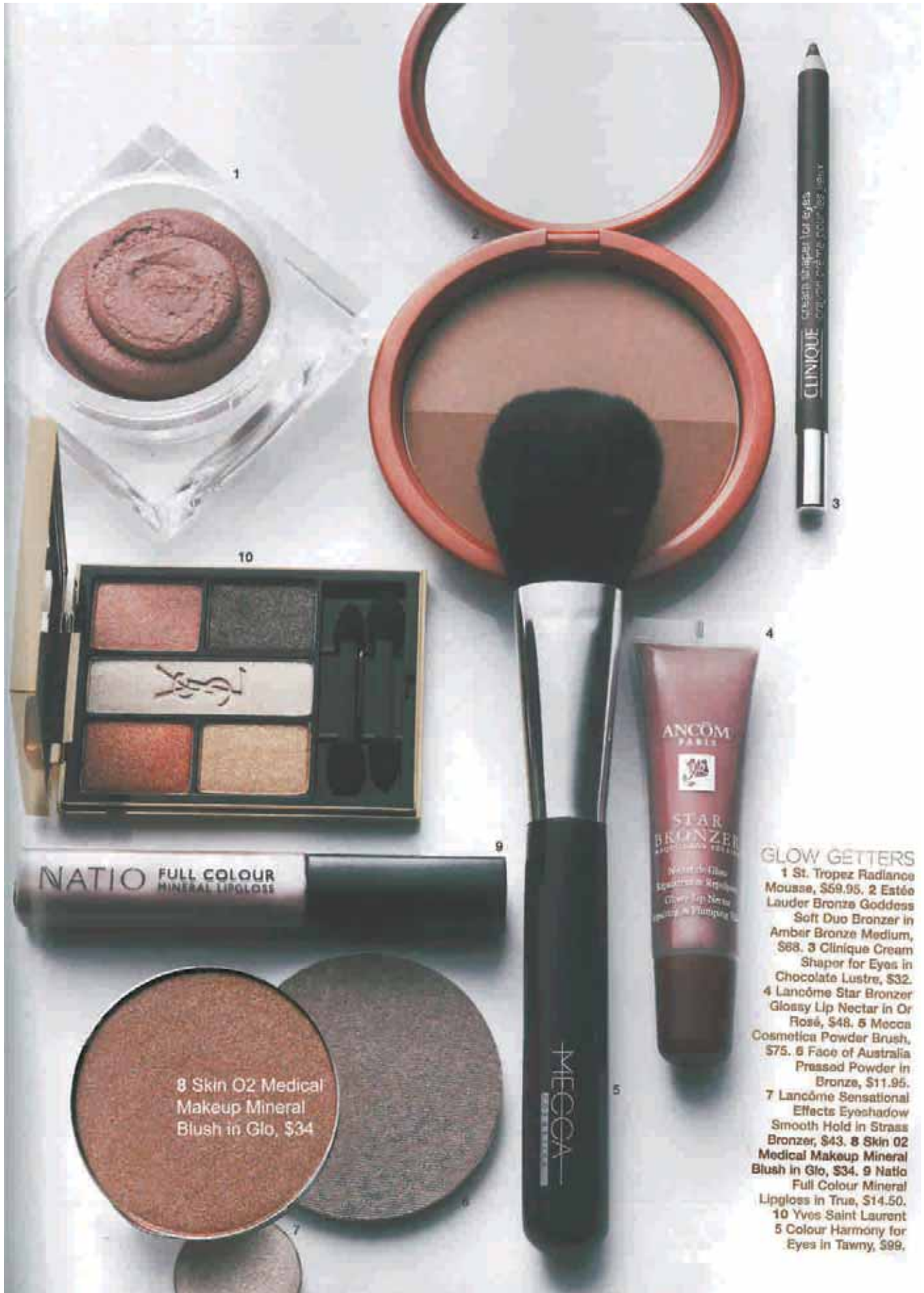
8 Skin O2 Medical Makeup Mineral Blush in Glo, $34