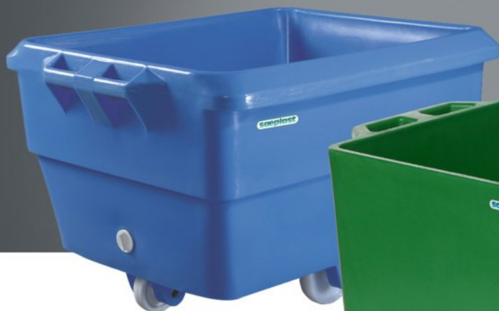
PUR Flurobin 340 Cart