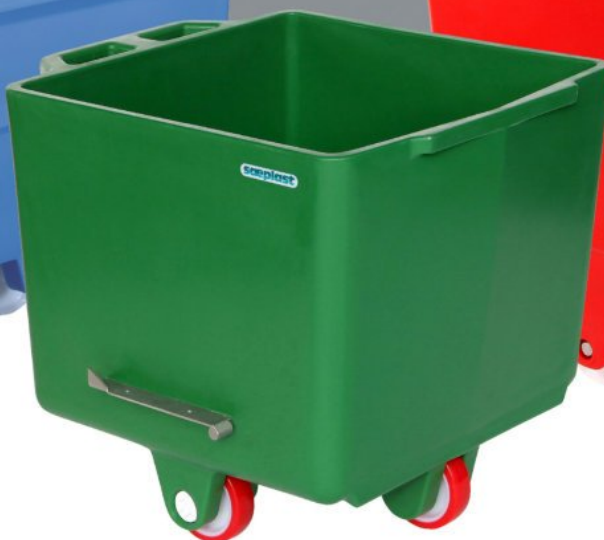
PE Flurobin 200 Buggy