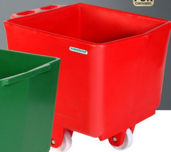
PUR Flurobin 185 Buggy