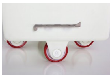
Integrated stainless steel brackets.