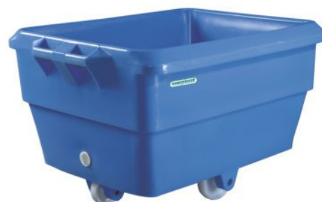
PUR Sæplast 340 Cart

The versatile Carts and Buggies are available in various colours enabling you to have dedicated Buggies for different colour coded zones.