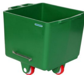
PE Sæplast 200 Buggy