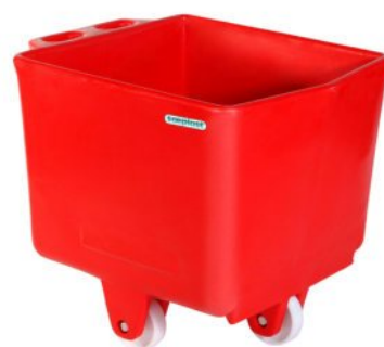
PUR Sæplast 185 Buggy