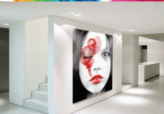
In-house decoration – dibond