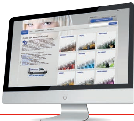
StoreFront web-to-print software