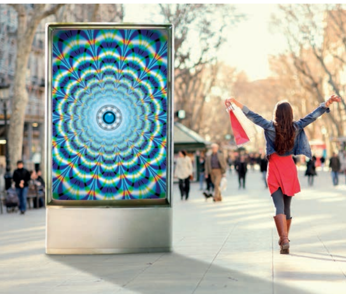
Outstanding print quality on backlit applications

Your day-to-day roll-to-roll sign & display jobs? Hand them over to your very solid Anapurna RTR3200i LED. This dedicated roll-to-roll UV LED-curable printer, which comes in a six color version and a four color plus white version, handles a broad scope of flexible media for indoor and outdoor applications.