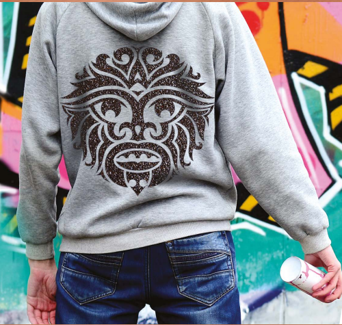
HEAT TRANSFER APPAREL