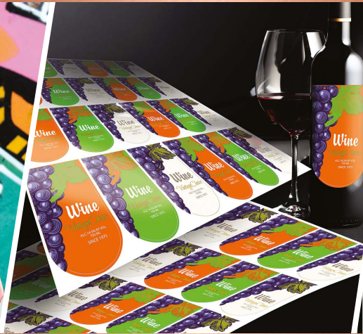
CONTOUR CUT LABELS