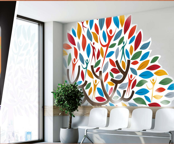
WINDOW AND WALL GRAPHICS