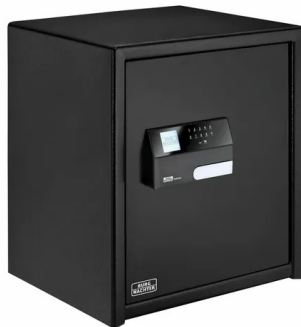
Art ID. PRS-540-E