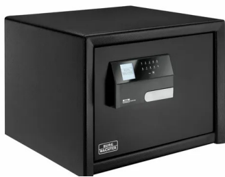
Art ID. PRS-520-E