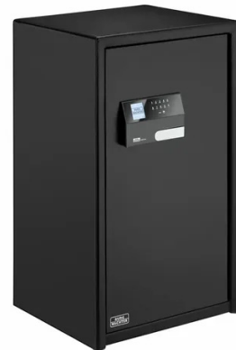
Art ID. PRS-580-E