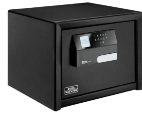
Art ID. PRS-510-E