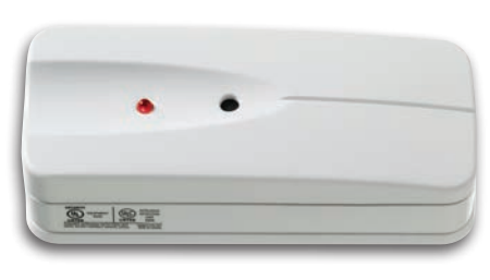
Glassbreak Detector WLS912L-433