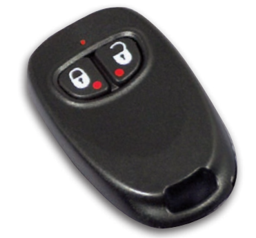
2 Button Key WS4949