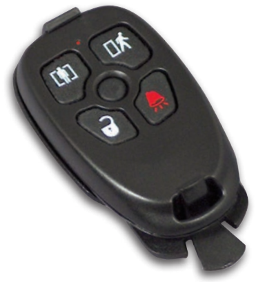
5 Button 12 Channel Key WS4959