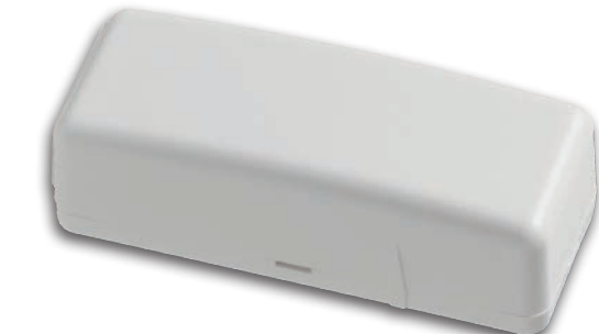
Door/Window Contact WS4945