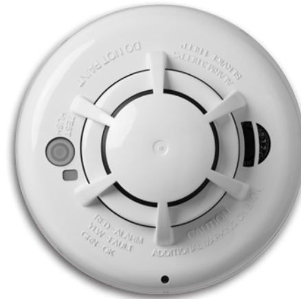
Wireless Photoelectric Smoke Detector WS4936