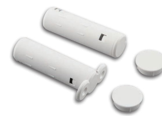
Recessed Door Transmitter EV-DW4917