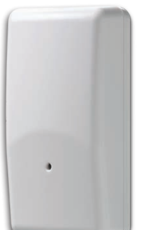
Tri-Zone Door/Window Contact WS4965