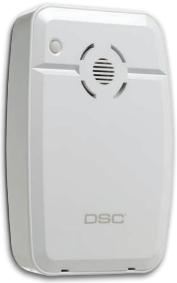
Indoor Siren* WT4901