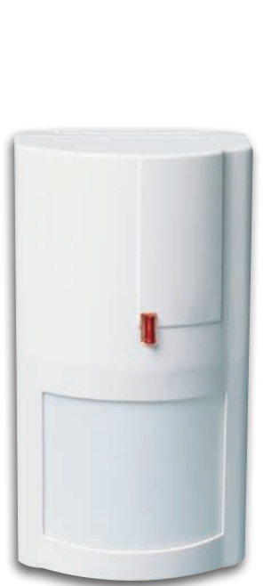
Pet Immune Detector 60 lbs (27 Kg) WS4904P