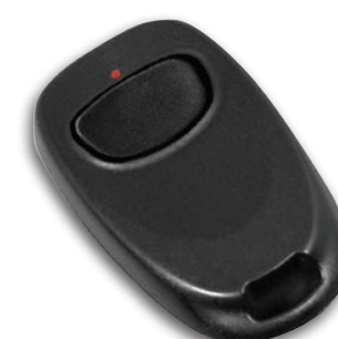
1-Button Personal Panic WS4938