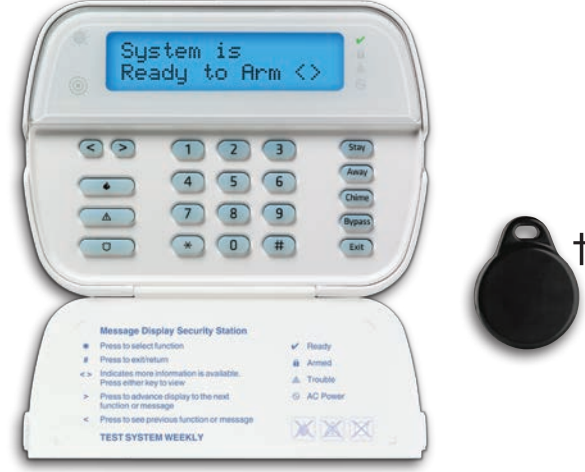
Wire-Free Keypad* WT5500/WT5500P**/WT5500D ** Shown on image † Proximity Tag