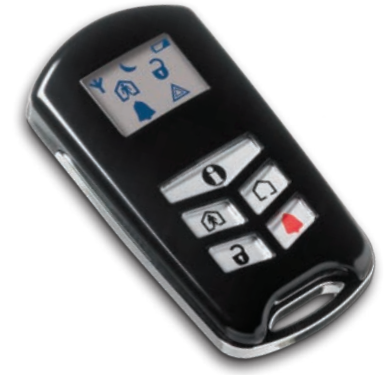
5 Button Key* WT4989