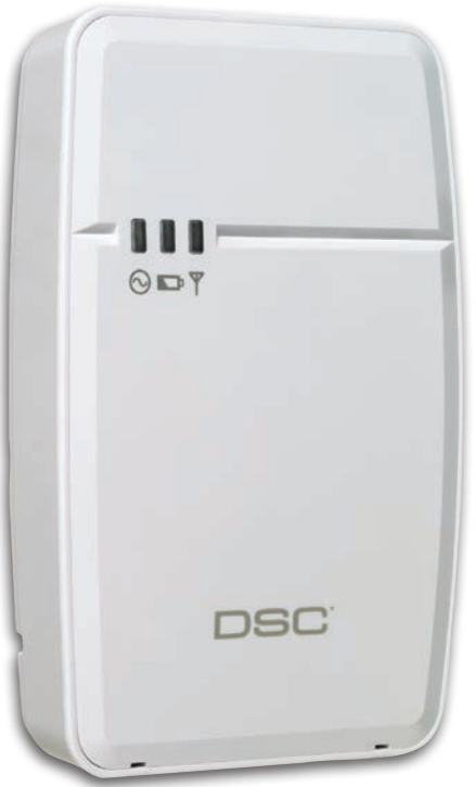
Wireless Repeater WS4920