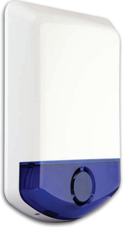
Outdoor Siren* WT4911