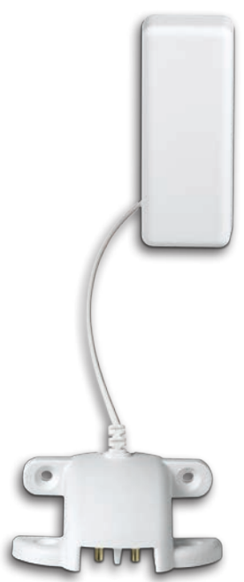
Flood Detector WS4985