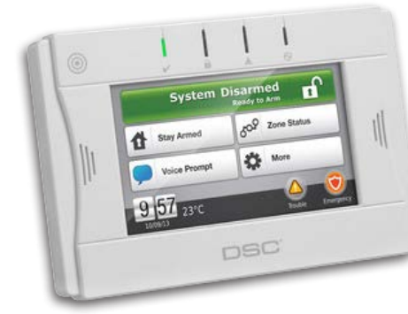
2-Way Wireless TouchScreen Arming Station WTK5504