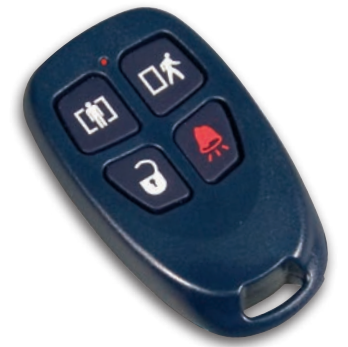
4 Button Key WS4939