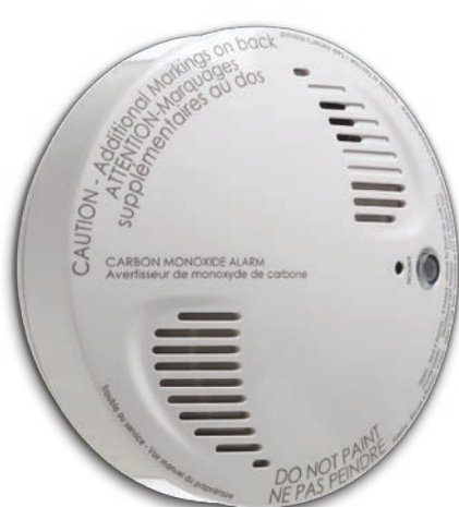
Carbon Monoxide Detector WS4913