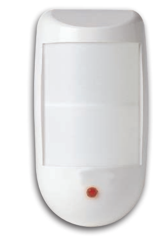
Pet Immune Detector 85 lbs (38 Kg) WLS914-433