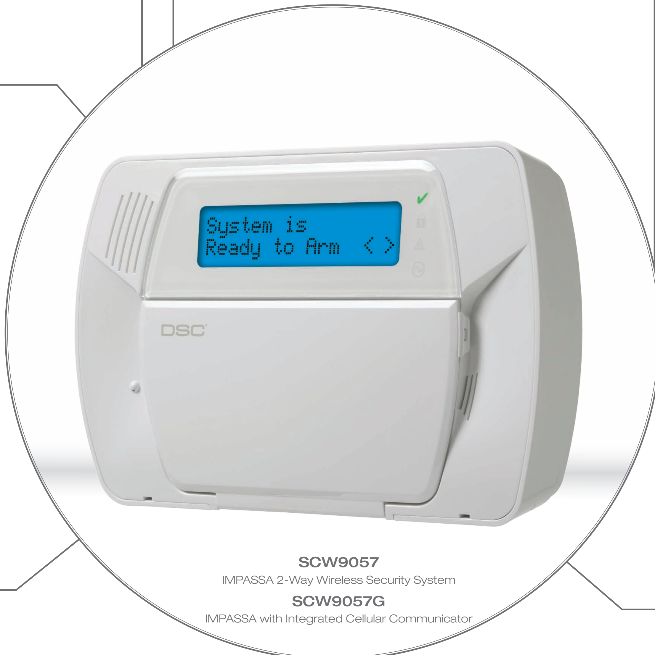
SCW9057 IMPASSA 2-Way Wireless Security System SCW9057G IMPASSA with Integrated Cellular Communicator