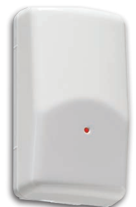
Shock Sensor EV-DW4927