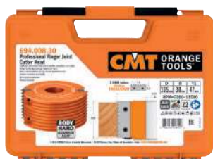
Supplied in a sturdy plastic carry case