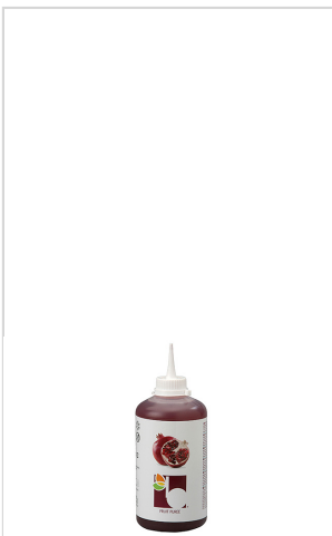
Puree 480 g Squeezable bottle

/en/products/technical_information/60_frozen-pomegranate-