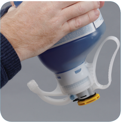
Patented Spill-Tite™ sonically-welded head eliminates leaking of concentrate.