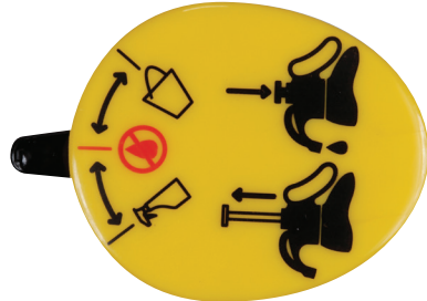
Control knob with easy-to-understand icons.