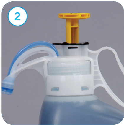
Pull up on control knob one time to prime the pump.