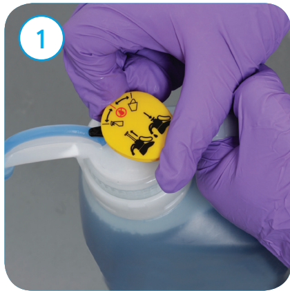
Turn the control knob to select the appropriate icon.