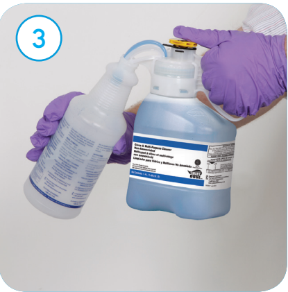
Push the knob down fully to pump a precise dose of concentrate needed for the correct dilution when mixed with water.