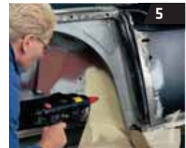
Reproducing the original factory underseal following repairs to door sills front and rear valances.