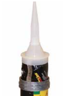
Placement of internal spray nozzle.