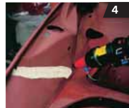
Narrow angle spray application for sealing flush seams.