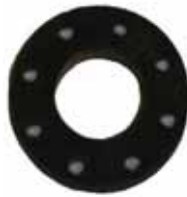
Airflow Equaliser for Jetflow Gun SFDIFFUSOR