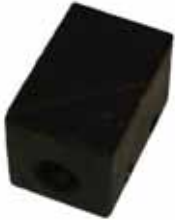
Rapid Action Coupling for Air hose NZ00319