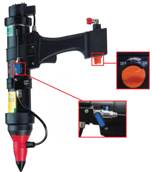
Switch positions on gun for spray application.