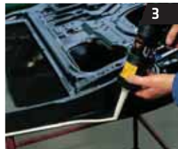
Bead application to seal lock seams, e.g. on door assembly or in engine compartment.