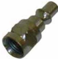
Connector for compressed air line A2609