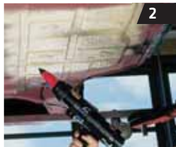
Wide angle spray application following repairs to floor pan, luggage compartment floor and wheel arches.