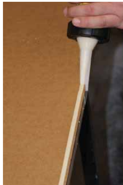
Apply bead to seal joints.