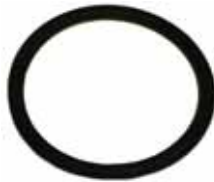
Dump valve O ring NZ00310