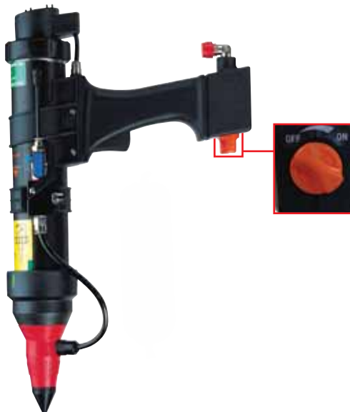
Set orange switch to correct position (low pressure works best) sealing.