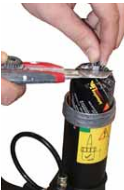
Cut the top off the sausage.