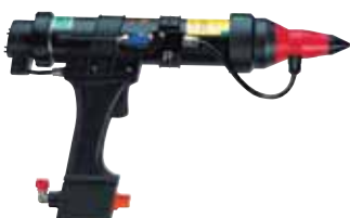
Sika Jetflow Gun SJFG