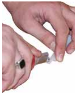
Trim the nozzle guide to the right size.