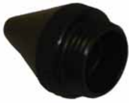
Nozzle for Jetflow Gun NOZSJFG