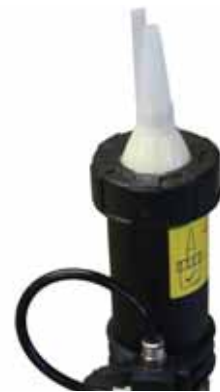
Place nozzle onto gun using black plastic end cap (NB: red spray cap is not used for bead application).