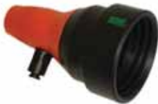
Spray cap for Jetflow Gun NZ00313