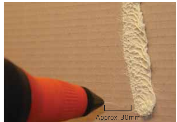
Narrow spray pattern (for sealing seams).