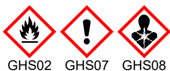
GHS02 GHS07 GHS08