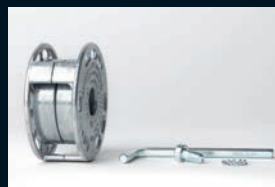
Adaptor System 23 mm Item Code AS-009