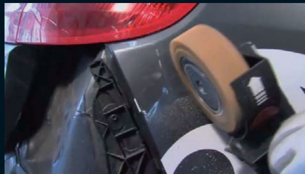
Removal of vinyl letters from vehicle

The wide and flexible paddles spread-out the area of contact while floating on a cushion of air protecting the painted surface from burning.