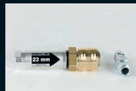
Air Pressure Regulator 23 mm Item Code ZU-071