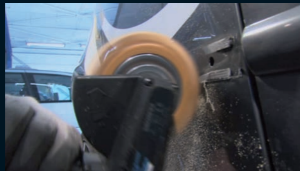
Removal of adhesive residues

The Vinyl Zapper® is installed using a specially designed MONTI adaptor system mounted onto either the MBX® pneumatic Heavy Duty or electric drive units.