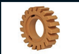
Vinyl Zapper® Item Code ZU-010-01