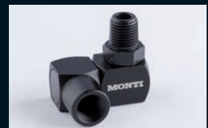
Swivel Connector for Air Supply Item Code ZU-073

MONTI - Werkzeuge GmbH Headquarter Hennef | Germany T +49 (0) 2242 9090 630 info@monti.de www.monti.de