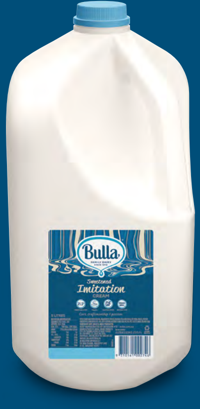
6020 Bulla Sweetened Imitation Cream 5L

Ideal for: Filling cakes and pastries, serving with desserts, mousses, fruit salad and makes a perfect filling for doughnuts.