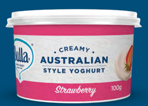
5000650 Bulla Australian Style Strawberry Yoghurt 100g