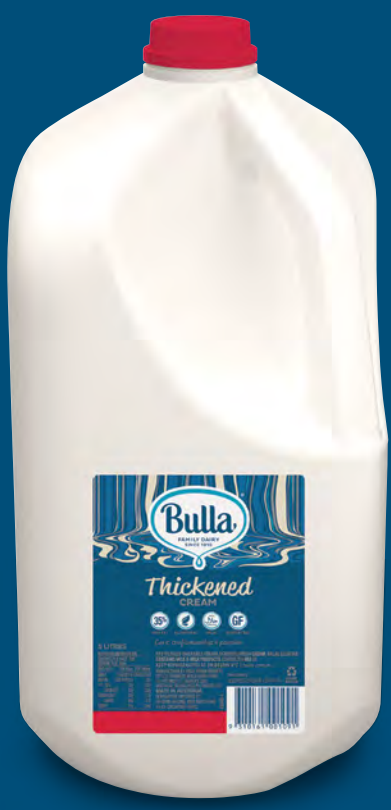
4015 Bulla Thickened Cream 5L

Ideal for: Cheesecakes, apple strudel, sweet cakes, fruits, savoury and sweet sauces, and rice puddings.