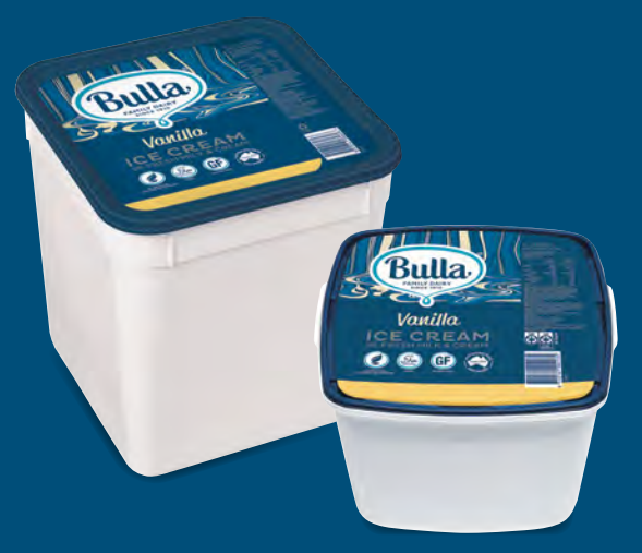
1006 Vanilla 10L 1011 Vanilla 2 x 5L

Bulla Real Dairy Ice Cream has a creamy smooth texture, superior taste and is great served with a range of popular desserts, for making milkshakes, thickshakes and iced coffee or served on its own.