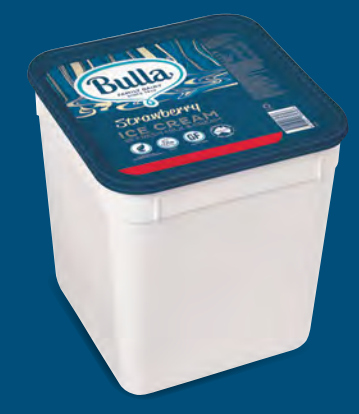
1008 Strawberry 10L