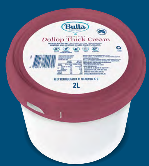
5000127 Bulla Dollop Thick Cream 2L

Ideal for: Filling cakes and pastries, serving with desserts, requires no whipping.