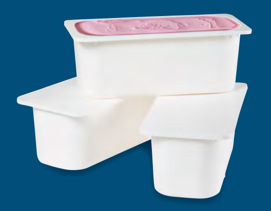
3512 Strawberry 3 x 5L