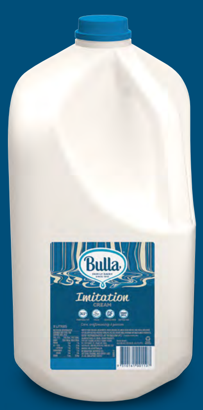
6010 Bulla Imitation Cream 5L

Ideal for: Filling cakes and pastries, serving with desserts, mousses, fruit salad and makes a perfect filling for doughnuts.