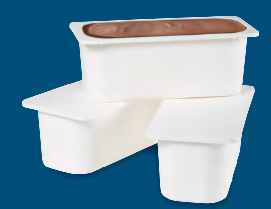
3511 Chocolate 3 x 5L