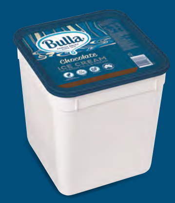
1007 Chocolate 10L