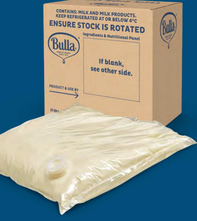
8143 Bulla Deli Style Sweetened Yoghurt 10kg

Ideal for: A sweet dessert style yoghurt that is perfect for decanting and serving with fruit, fruit coulis or muesli.