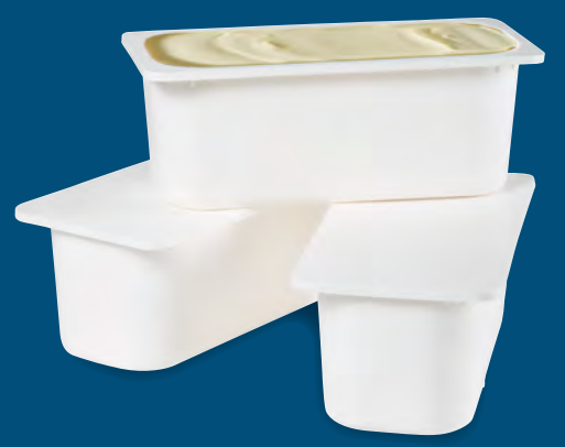
3510 Vanilla 3 x 5L

Bulla Real Dairy Ice Cream is the perfect accompaniment to any dish and the 5L trays allow for optimal scoopability. It has a creamy smooth texture, superior taste and is great served with a range of popular desserts, for making milkshakes, thickshakes and iced coffee or served on its own.