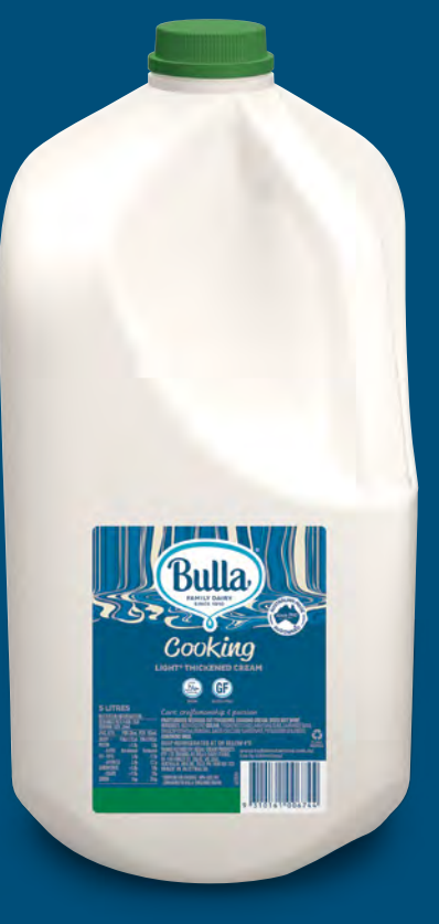
4014 Bulla Cooking Cream 5L