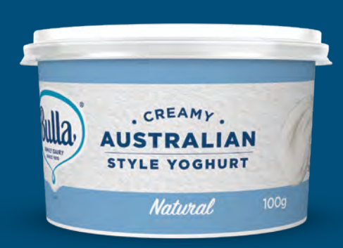
5000561 Bulla Australian Style Natural Yoghurt 100g