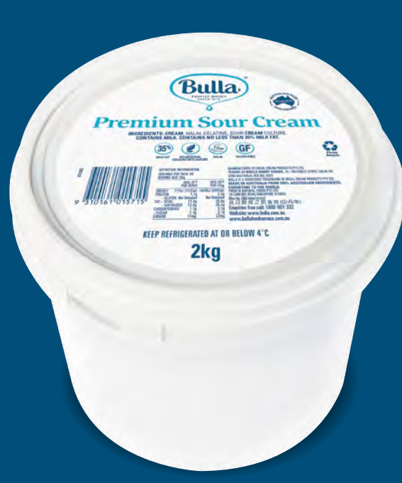
5000126 Bulla Premium Sour Cream 2kg

Ideal for: Perfect in cheesecakes and on baked potatoes, as well as an ideal dip base or dolloped on savoury dishes.