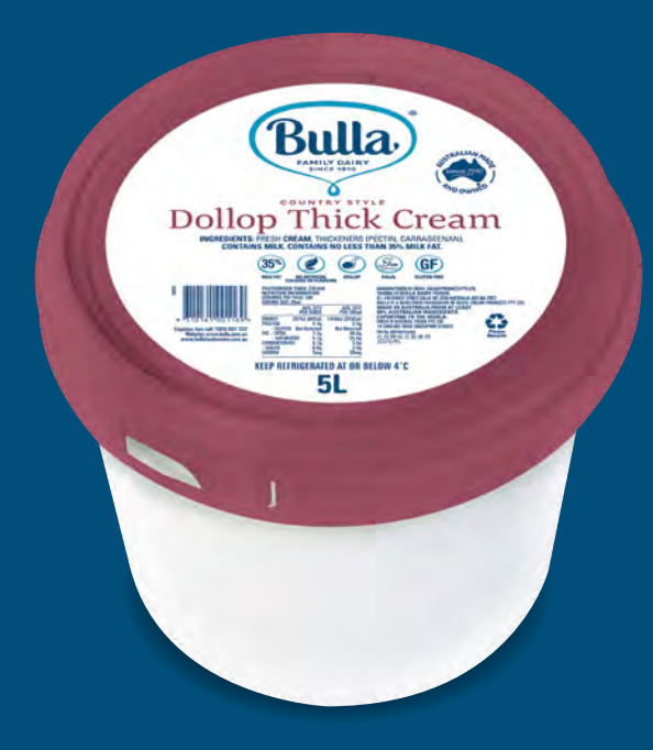
4045 Bulla Dollop Thick Cream 5L