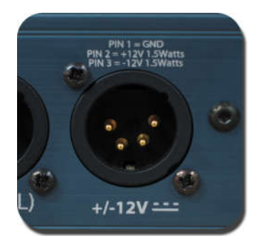
12V DC Power Connection

All Signature units (except PS1) have a 4 pin XLR ±12V DC socket for connection to the PS1 Power Station. This can act as the primary or backup power source.