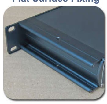
Side Wings For Flat Surface Fixing

A Signature unit has side wings with mounting holes at the top and bottom, allowing flush fixing from above OR underneath.