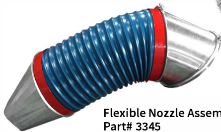
Flexible Nozzle Assembly - Part# 3345 Various lengths available. Ideal for rough terrain.