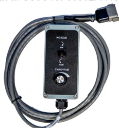
Part# 5579 for 8000EFI Model

WARNING: Cancer & Reproductive Harm - www.P65Warnings.ca.gov