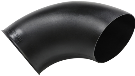
Aerospace Polymer Nozzle - Part# 5167