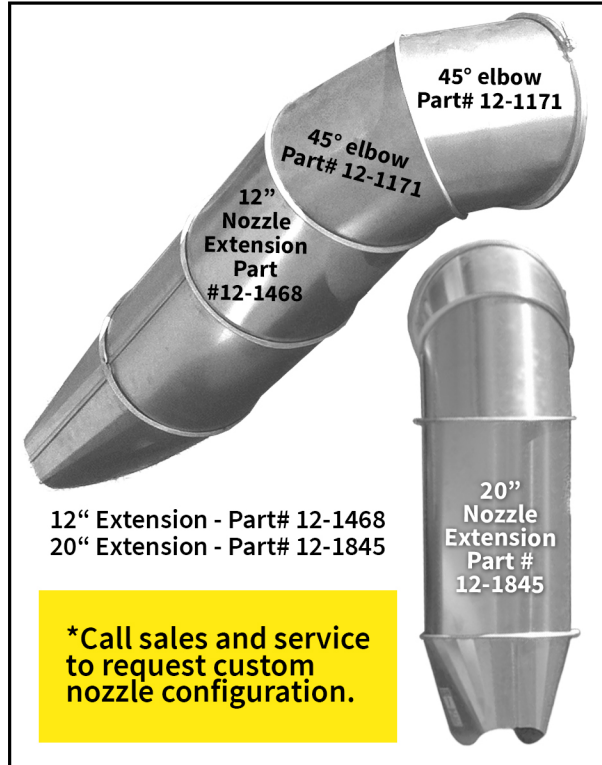
12" Extension - Part# 12-1468 20" Extension - Part# 12-1845

*Call sales and service to request custom nozzle configuration.