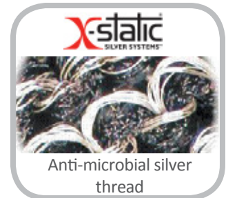
Anti-microbial silver thread