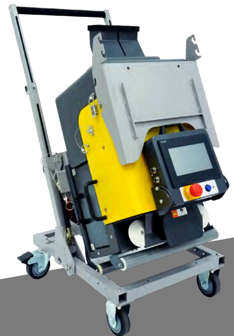
X-Pad+ Mobile for easily demonstration in clients' warehouse