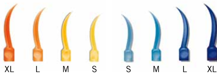
Colour coding of the wedges according to size and curve

The Curvy wedges are curved either clockwise or counter-clockwise. This allows the three-dimensionally shaped wedges to be easily positioned in each quadrant, both from oral and vestibular.