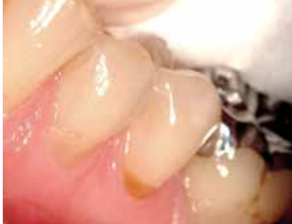
Tooth 35 with cervical defect