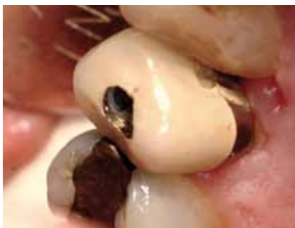
Crown 14, access preparation