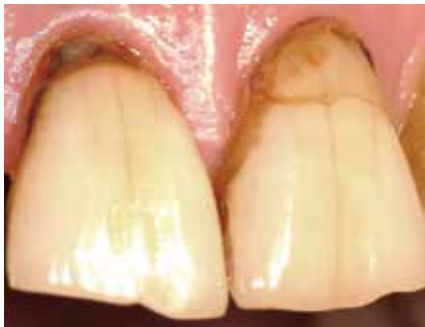
Cervical caries on upper front teeth