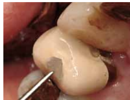
... and sealing after endodontic treatment