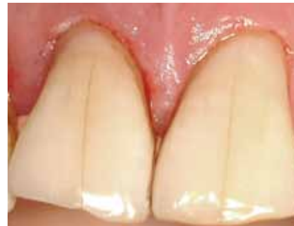
... final restoration