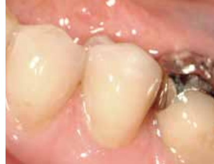
Tooth 35 immediately after treatment