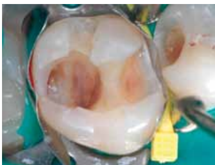
Pain case: teeth 16, 15 after excavation