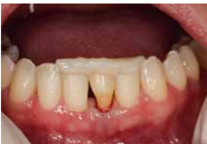
Fixation of the actual condition with composite before the extraction