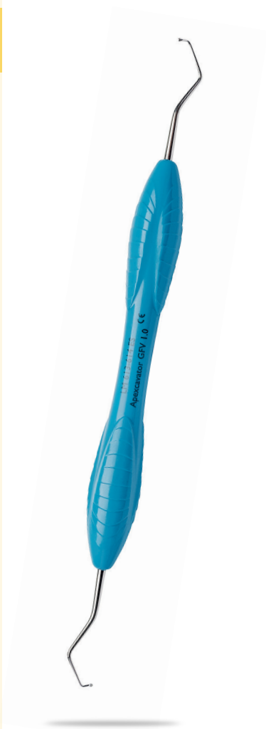
Apexcavator GFV 1.0 mm

For the removal of demineralized dentin, guttapercha and cement from the tip of the root.