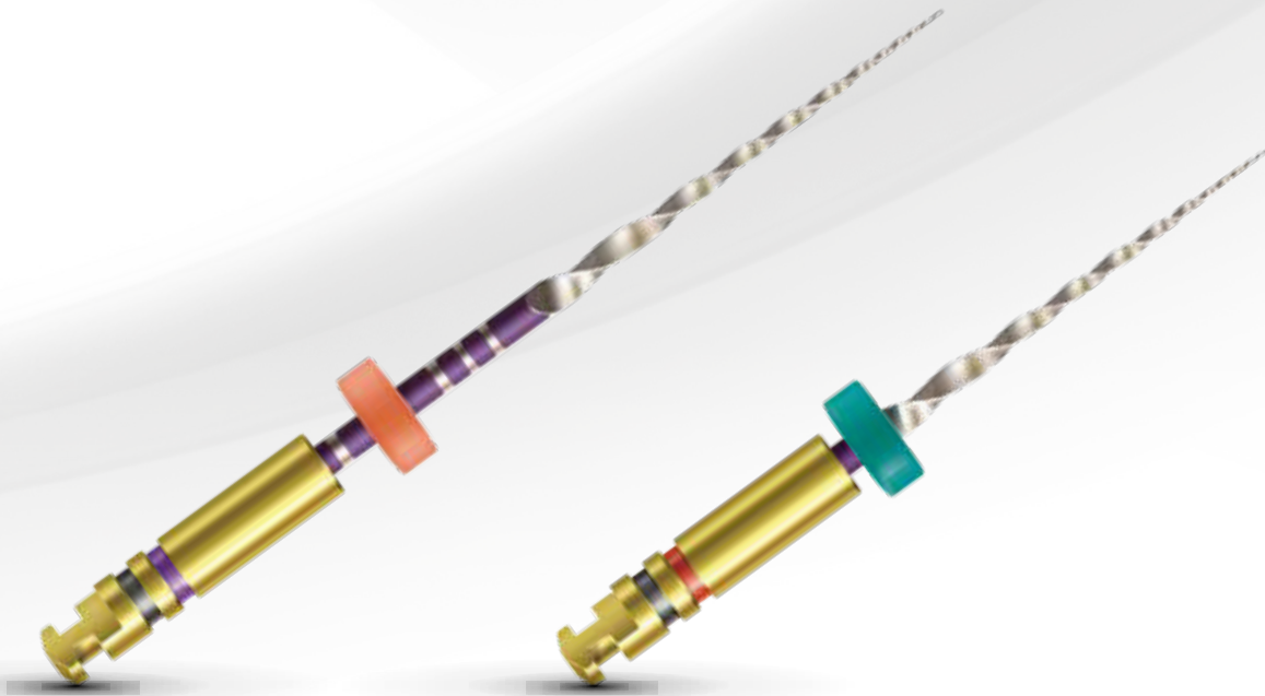
Rotary glide path file

Own the glide path with speed and safety