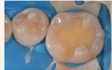
CR removal and prep