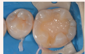
using universal opaque