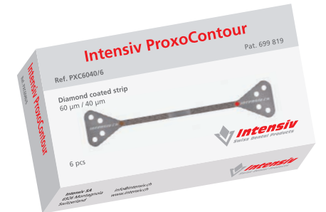
Pack of 6 strips Ref. PXC6040/6