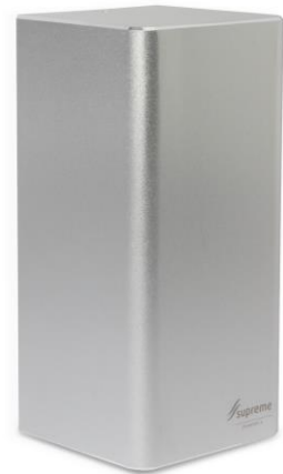
Silver - DD60V-S