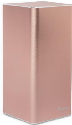
Rose Gold - DD50V-RG