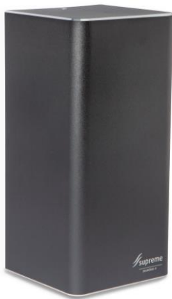
Titanium - DD40V-T