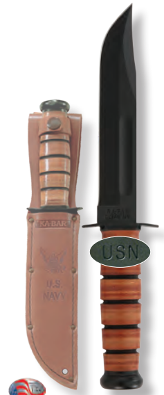
USN Leather Sheath

Blade Length: 7" Blade Width: 1.188" Overall Length: 11.875" Sheath: 1225S-USN