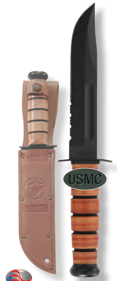
USMC Serrated Leather Sheath

Blade Length: 7" Blade Width: 1.188" Overall Length: 11.875" Sheath: 1217S-USMC