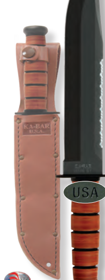
Big Brother Leather Leather Sheath

Designed in cooperation with Strategic Edge Impact Global Enterprise (S.E.I.G.E.) of Webster, NY