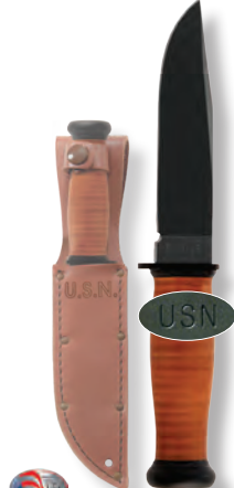
Mark I Leather Sheath

KA-BAR® is unable to ship this item to certain states including CA and MA.