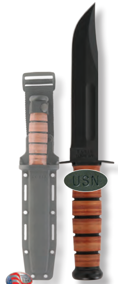
USN Hard Plastic Sheath (MC)

Blade Length: 7" Blade Width: 1.188" Overall Length: 11.875" Sheath: 1216S-KA-BAR*