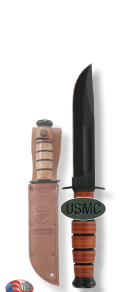
USMC Short Leather Sheath

Blade Length: 5.25" Blade Width: 0.906" Overall Length: 9.5" Sheath: 1250S-USMC