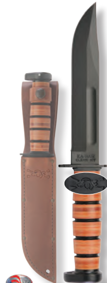
Dog's Head Utility Leather Sheath

Blade Length: 7" Blade Width: 1.188" Overall Length: 12" Sheath: 1317S-Dog's Head