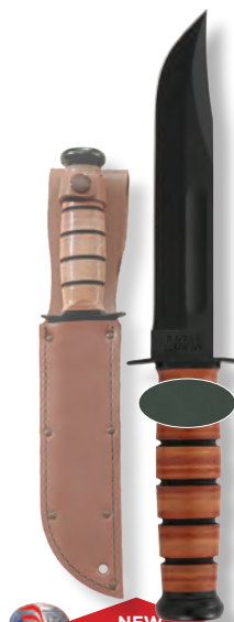
Single Mark KA-BAR Leather Sheath

Blade Length: 7" Blade Width: 1.188" Overall Length: 11.875" Sheath: 1217I