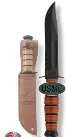
USMC Short Serrated Leather Sheath

* Clam Pack available for these items. Simply place a "CP" following the item number when ordering. Sheaths denoted with (MC) are MOLLE compatible.