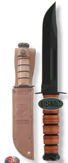
USMC Leather Sheath

* Clam Pack available for these items. Simply place a "CP" following the item number when ordering. Sheaths denoted with (MC) are MOLLE compatible.