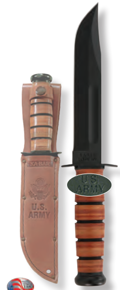
U.S. ARMY Leather Sheath

Blade Length: 7" Blade Width: 1.188" Overall Length: 11.875" Sheath: 1220S-U.S.ARMY