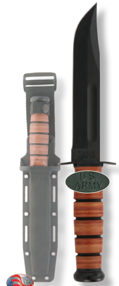
U.S. ARMY Hard Plastic Sheath (MC)

Blade Length: 7" Blade Width: 1.188" Overall Length: 11.875" Sheath: 1216S-KA-BAR*