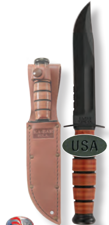
USA Short Serrated Leather Sheath

Blade Length: 5.25" Blade Width: 0.906" Overall Length: 9.25" Sheath: 1251S-U.S.A.