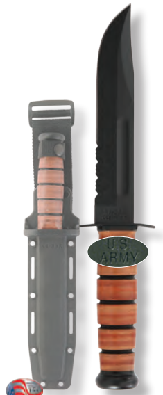
U.S. ARMY Serrated Hard Plastic Sheath (MC)

Blade Length: 7" Blade Width: 1.188" Overall Length: 11.875" Sheath: 1216S-KA-BAR*