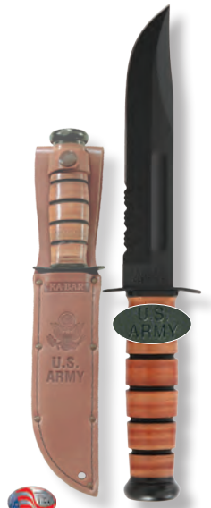
U.S. ARMY Serrated Leather Sheath

Blade Length: 7" Blade Width: 1.188" Overall Length: 11.875" Sheath: 1220S-U.S.ARMY