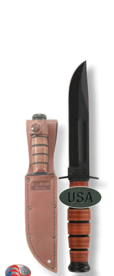
USA Short Leather Sheath

Blade Length: 5.25" Blade Width: 0.906" Overall Length: 9.5" Sheath: 1251S-U.S.A.