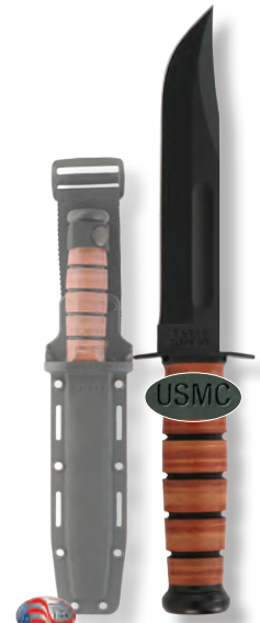
USMC Hard Plastic Sheath (MC)

Blade Length: 7" Blade Width: 1.188" Overall Length: 11.875" Sheath: 1216S-KA-BAR*