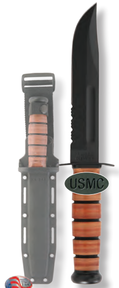
USMC Serrated Hard Plastic Sheath (MC)

Blade Length: 7" Blade Width: 1.188" Overall Length: 11.875" Sheath: 1216S-KA-BAR*