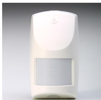
Part No. 100-226