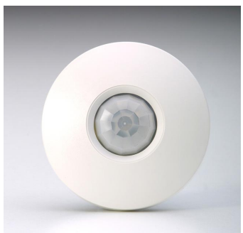
Part No. 100-048