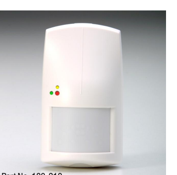
Part No. 100-210