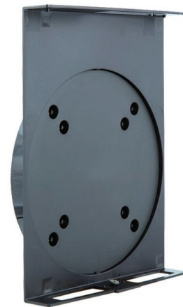
Rotating VESA-Mount Bracket (snaps over top and bottom of Appliance)