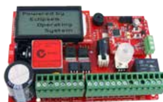
Control card with Eclipse® Operating System