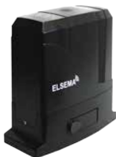
iS900 sliding gate motor