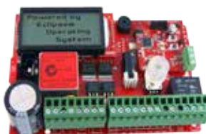
Control card with Eclipse® Operating System