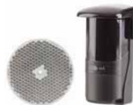
Long range reflector type photo electric beam