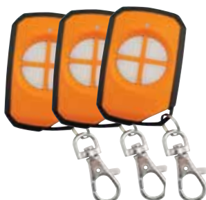
3 x Keyring remotes with frequency hopping