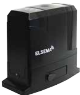
iS600 sliding gate motor