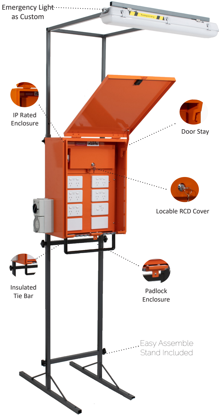
*Image: TPB-3PT5.532 with Custom LED IP65 Emergency Light