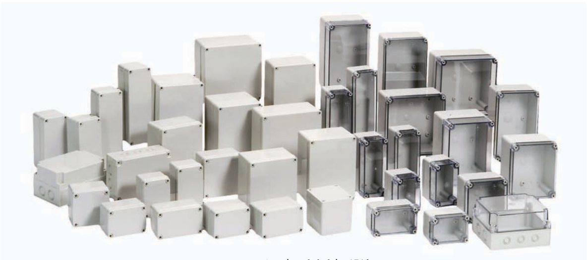
S Design / S 디자인 / S 设计 50x60x45 ~ 210x230x100mm