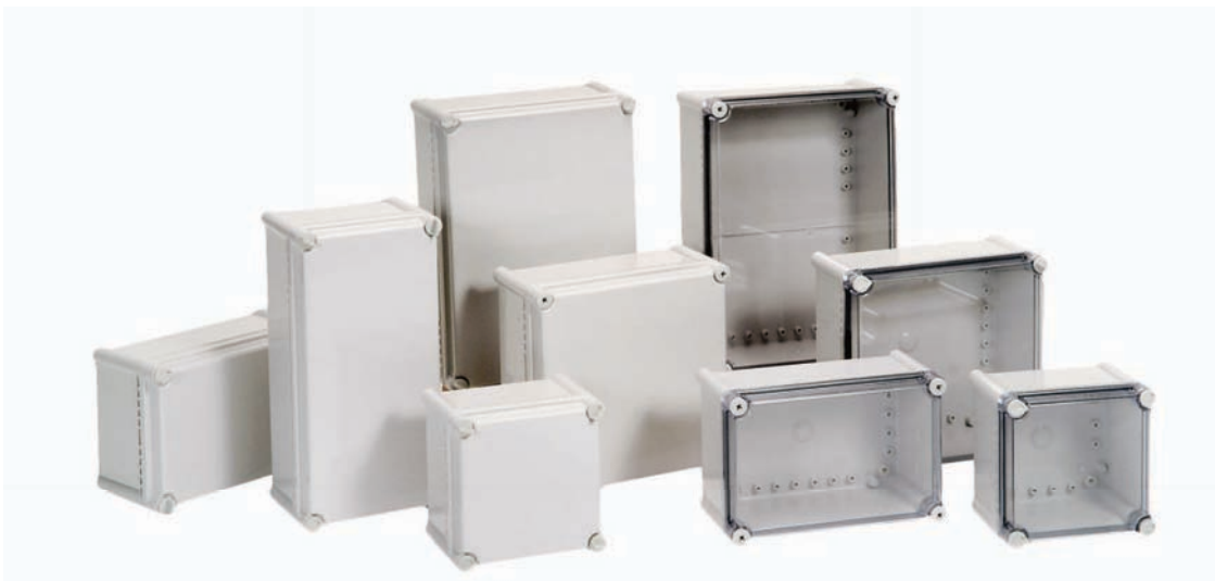
M Design / M 디자인 / M 设计 190x190x130 ~ 380x560x180mm