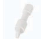
[ Cover screw(standard, CB20-) ]