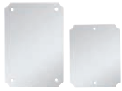
[ Steel mounting plate ]