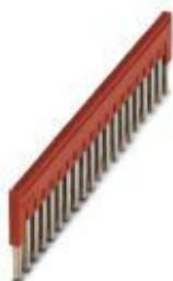
Plug-in bridge, pitch: 5.2 mm, number of positions: 20, color: red

Please be informed that the data shown in this PDF Document is generated from our Online Catalog. Please find the complete data in the user's documentation. Our General Terms of Use for Downloads are valid ( http://phoenixcontact.com/download )