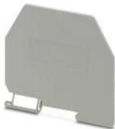
Partition plate, length: 99 mm, width: 2 mm, height: 90 mm, color: gray

Please be informed that the data shown in this PDF Document is generated from our Online Catalog. Please find the complete data in the user's documentation. Our General Terms of Use for Downloads are valid ( http://phoenixcontact.com/download )