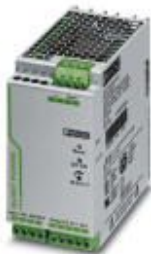
Primary-switched QUINT POWER power supply for DIN rail mounting with SFB (Selective Fuse Breaking) Technology, input: 3-phase, output: 24 V DC/20 A

Please be informed that the data shown in this PDF Document is generated from our Online Catalog. Please find the complete data in the user's documentation. Our General Terms of Use for Downloads are valid ( http://phoenixcontact.com/download )