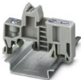
End clamp, width: 9.5 mm, height: 35.3 mm, material: PA, length: 50.5 mm, Mounting on a DIN rail NS 32 or NS 35, color: gray

Please be informed that the data shown in this PDF Document is generated from our Online Catalog. Please find the complete data in the user's documentation. Our General Terms of Use for Downloads are valid ( http://phoenixcontact.com/download )