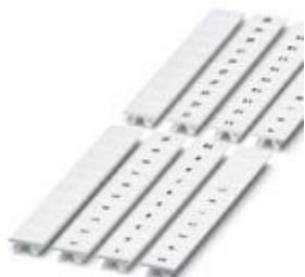
Zack marker strip, 10-section, vertically labeled with the consecutive numbers: 11 ... 20, white, width: 8 mm

Please be informed that the data shown in this PDF Document is generated from our Online Catalog. Please find the complete data in the user's documentation. Our General Terms of Use for Downloads are valid ( http://phoenixcontact.com/download )