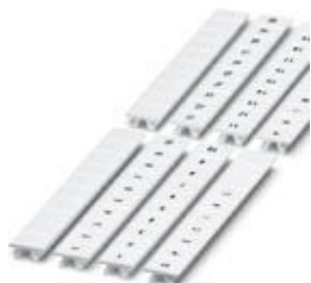
Zack marker strip, 10-section, vertically labeled with the consecutive numbers: 1 ... 10, white, width: 8 mm

Please be informed that the data shown in this PDF Document is generated from our Online Catalog. Please find the complete data in the user's documentation. Our General Terms of Use for Downloads are valid ( http://phoenixcontact.com/download )