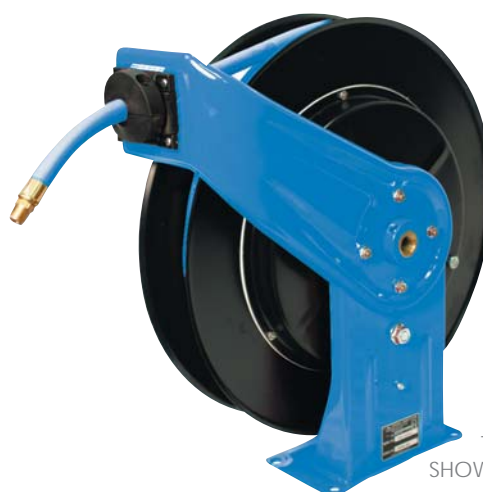
7800 OMP 106 SHOWN WITH HOSE

The base and guide arm are formed from high-grade pressed steel and the engineered structural forms within these parts gives the 7000 Series its strength.